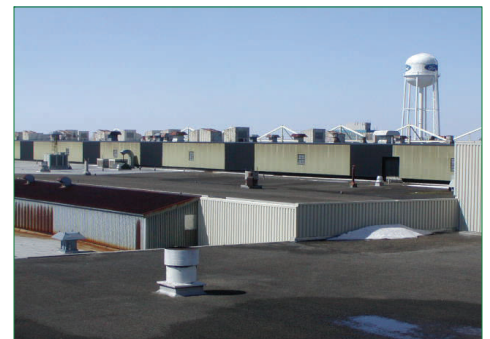
Photo Above: Overview of Coal-Tar-Pitch roof sections covering Ford Buffalo Stamping Plant

Royal Roofing is spending the majority of the 2007 Summer on this job. To the contrary, the targeted completion time is thirty days! As a result of being one of the Biggest (And Best) commercial roofing companies in the Mid-West, Royal is able to be flexible and thus capable to divert resources to complete even the biggest jobs, anywhere in the country, in a timely manner.