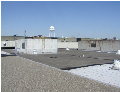
Photo Above: View of Ford Buffalo Stamping Plant, overlooking the multiple sections that Royal will be replacing.

Bordering the shores of Lake Erie, about thirty miles South of Niagara Falls is the city of Hamburg, New York, and the site of the latest Royal Roofing project. Hamburg is located in central Erie County along the eastern shores of Lake Erie directly south of the cities of Lackawanna and Buffalo, New York. The town encompasses an area of approximately 42 square miles, the largest amongst towns in Erie County, and has a population of 56,259 according to the 2000 United States Census. Also located in the town of Hamburg is a significant Automotive presence belonging to Ford Motor Company; the Ford Buffalo Stamping Plant. Although there has not been a percentage assigned to the population of Hamburg as to whom are employed at the plant, as pointed out by the city's Community Development and Assessors office, but it stands to be a substantial fraction.