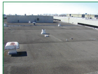
Photos Above-Left: Ford Buffalo Stamping Plant roof sections to be replaced.