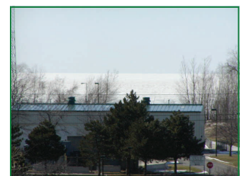
Photos Above-Right: From the plant roof, a look at an ice filled Lake Erie.