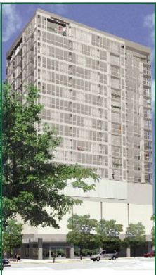
Photo Above: Future Rendering of "The Fifth of Royal Oak" after all phases of construction have been completed; including the roof! Photo Below: Glance at revolutionary White TPO Fully Adhered Single Membrane Roof System; on-top of the Fifth!

Phone: (248) 276-7663 Fax: (248) 276-9170 www.royalroofingco.com