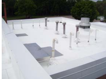
Photo Above: After Replacement ↑ Bottom Photo: Before Replacement ↓